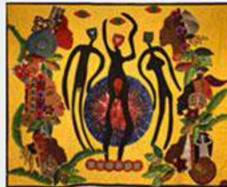
Circle of Sacred Sisters