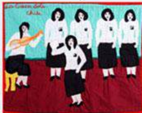
They Dance Alone